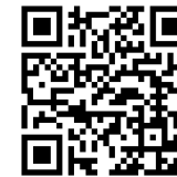
SoA Scholarship QR Code

friends to offer assistance to current students on the path to becoming a professional in the world of Architecture. All donations are expended the next year, immediately providing scholarships to deserving students in our programs. Please help us reach our goal of $25,000 by the end of 2020!