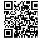
O'Hara Fund QR Code