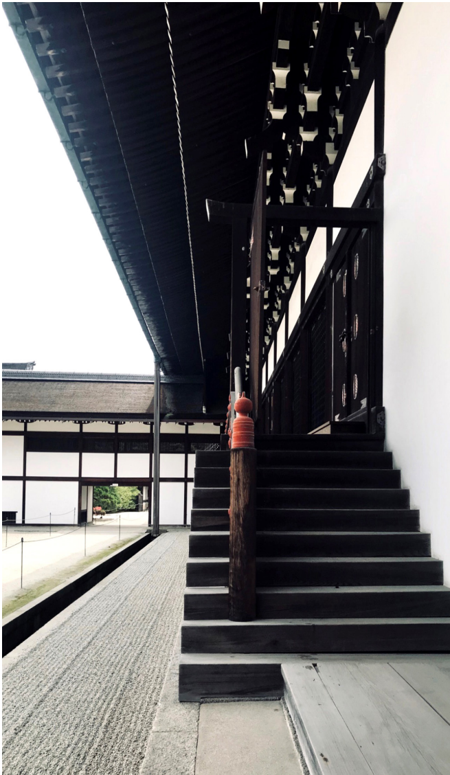
KYOTO IMPERIAL PALACE

The program provides both the HUMANITIES (H) and CONTEMPORARY INTERNATIONAL CULTURES (I) designations, emphasizing the study of contemporary Asian cultures. The course will provide historical reference points, but will focus on how those references and the broader culture have led to developments within contemporary Asian society. For example, the study of the complex, rich, and dynamic history of Hong Kong and the cultural influences of the societies which have shaped it over the last 200 years (Chinese, Japanese, British), and its location as a regional hub, will provide an understanding and backdrop for our area of focus: looking at how these issues have shaped the current city. We will explore issues of urban density and networks, public space, government influence, and climatic and sustainability challenges. How have the cities grown out of these issues, and how do specific contemporary works of architecture reflect these?