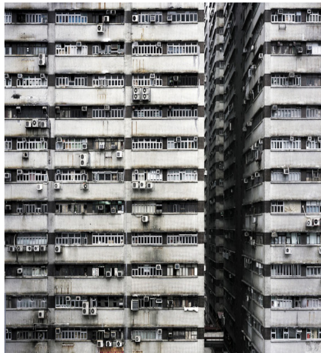
INDUSTRIAL 07