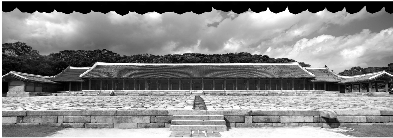
JONGMYO SHRINE, image by Seung Ra

Note: Airfare between US and Asia, food, and other expenses are excluded.