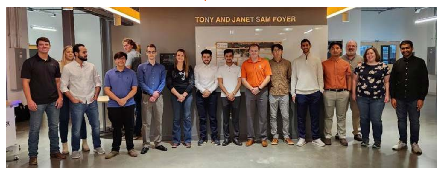
Next Expo is April 28, 2023 - plan to attend!