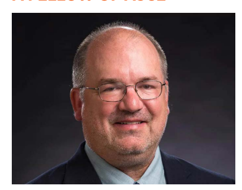
Full story here