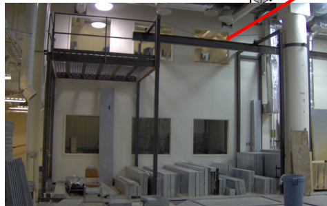
Mezzanine and heavy duty gantry crane