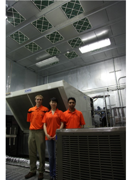
Fig 1: OSU outdoor psychrometric chamber showing both a commercial RTU and a split-system outdoor unit.