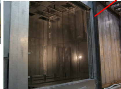
Product flow in/out door