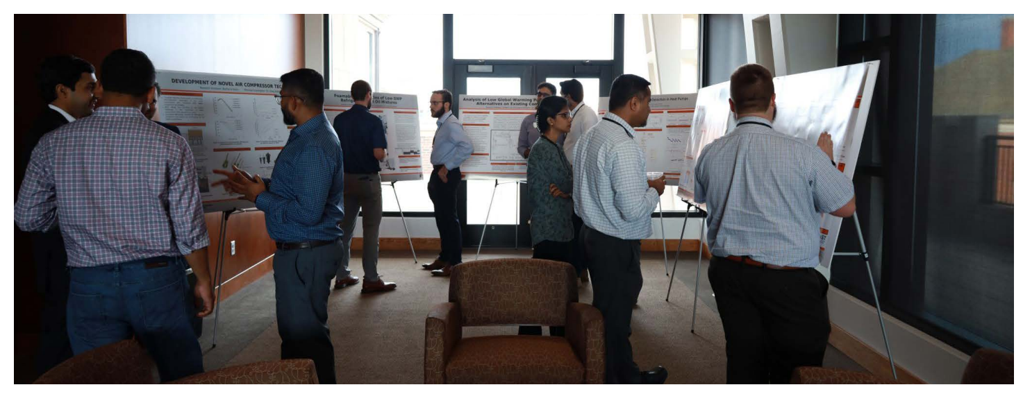
CIBS graduate and undergraduate students presented research results and discussed future and ongoing research projects with center members.