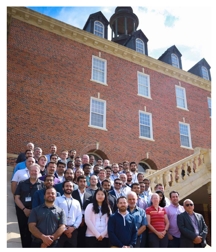
Engineers and scientists from 11 industry partners joined students and faculty on the Stillwater campus for the CIBS meeting.