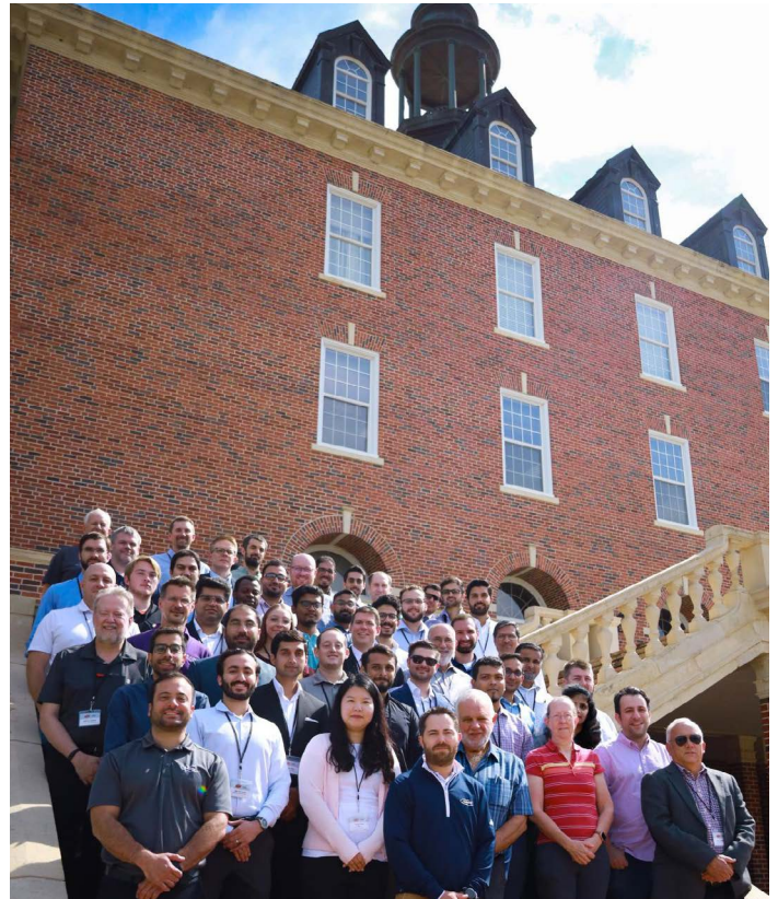
Engineers and scientists from 11 industry partners joined students and faculty on the Stillwater campus for the CIBS meeting.