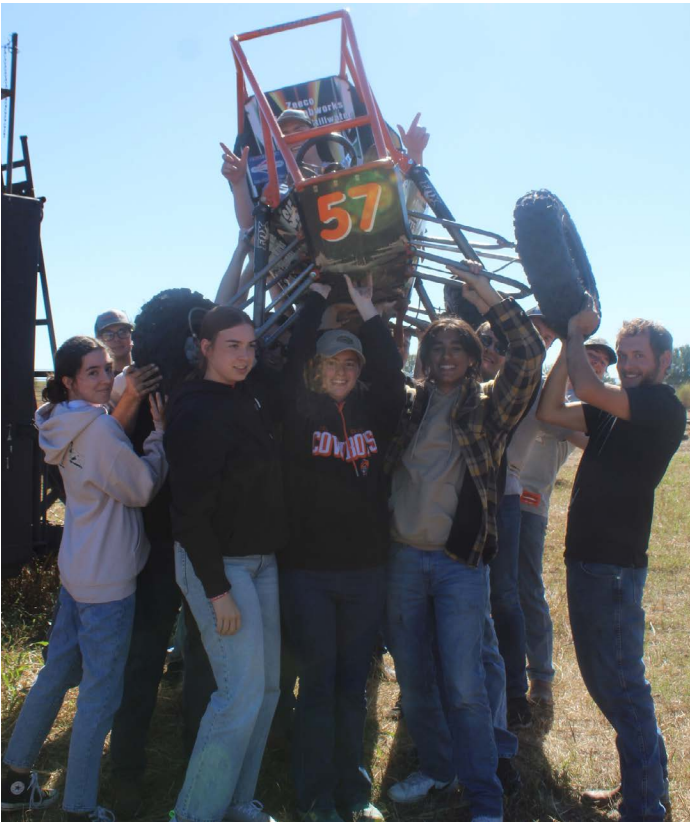
Kansas State and the University of Oklahoma joined the Cowboy Racing team for their annual Fall Frenzy.