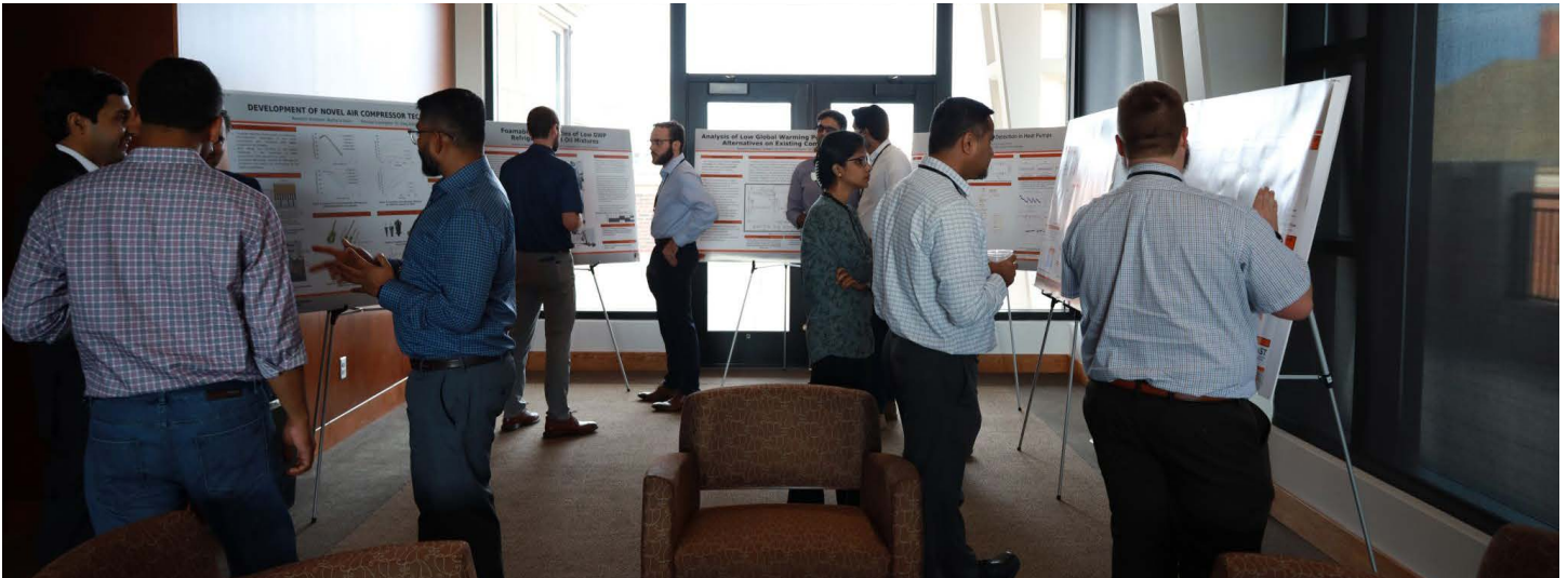
CIBS graduate and undergraduate students presented research results and discussed future and ongoing research projects with center members.