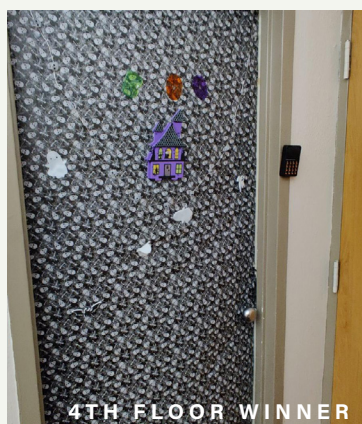
4TH FLOOR WINNER