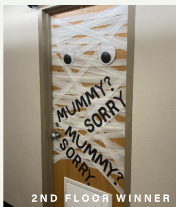
2ND FLOOR WINNER