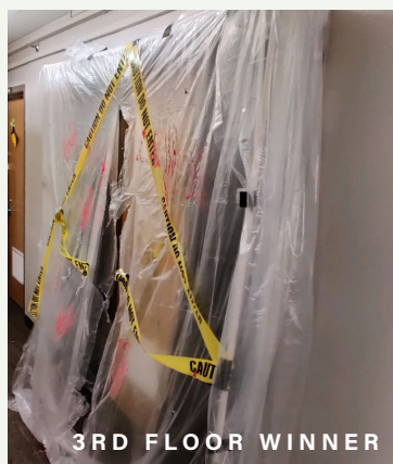
3RD FLOOR WINNER