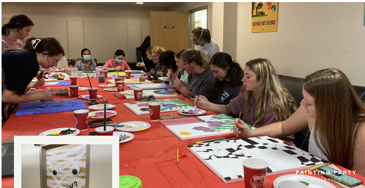
PAINTING PARTY Relaxing Fun